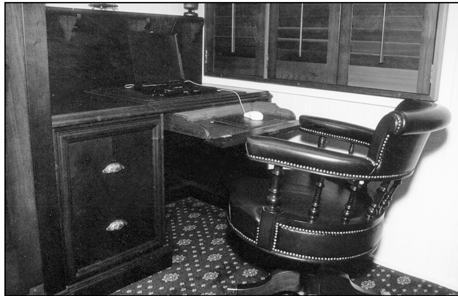
Custom built-in Cedar Desk with two reproduction Cedar Filing Drawers underneath, all done in the early Australian style. Note the pullout computer keyboard drawer, the traditional backboard and high shelf. This reproduction 1910 Cedar Desk Chair features antiqued English reproduction brass castors, a spindle back and deep buttoned English leather upholstery.