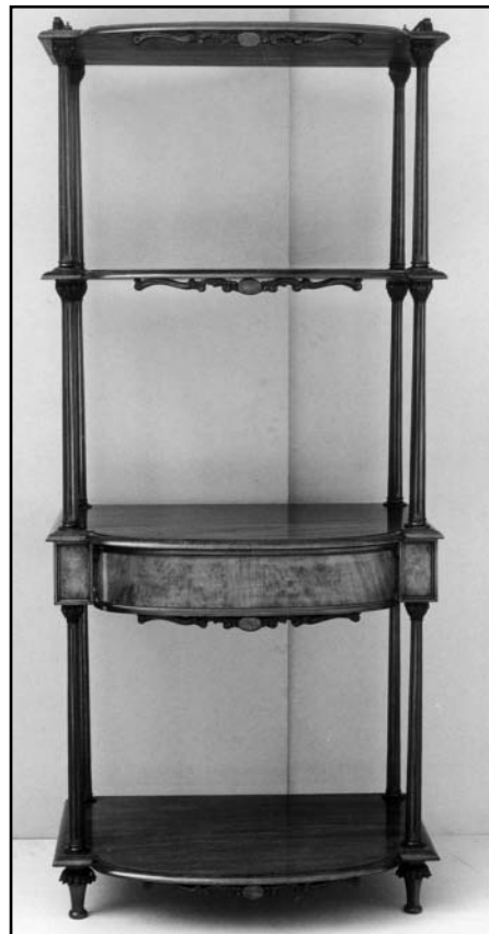
Reproduction Mahogany Regency Whatnot with four tiers including a dovetailed, burr myrtle veneered drawer and feature panels. The whatnot is supported by Corinthian tapered fluted columns and each burr myrtle veneer medallion is accompanied by subtle decorative carving.