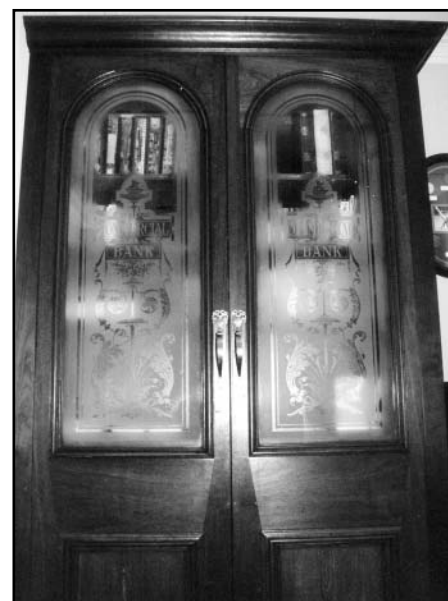
Custom Cedar Bookcase featuring original doors from the Rockhampton Commercial Bank. The ornate etched glass is complemented by the reproduction antiqued English brass handles.

was then made to comfortably seat him at the correct height for his desk. The desired height of desks and tables has increased over the years, so chairs can require some adjustment.